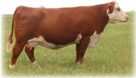
MSU RACHAEL 58Z ET