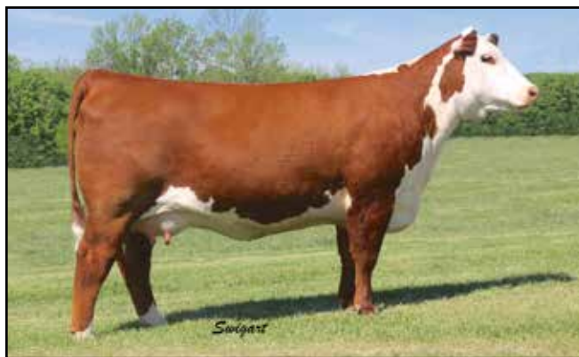
CSF 18U OLIVIA 2102 MATERNAL GRANDDAM OF LOT 37