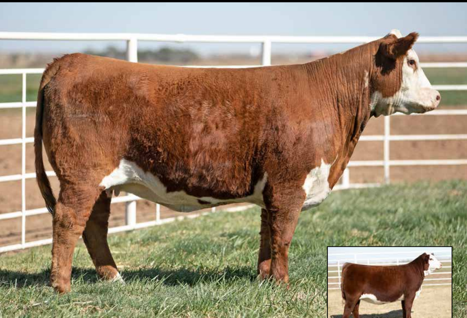
LOT 120 BR GRACE KO15 ET