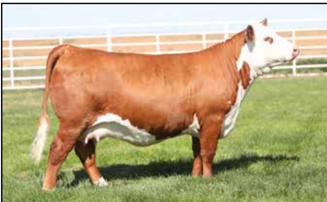
BR ARIEL H032 ET DAM OF LOT 210 EMBRYOS