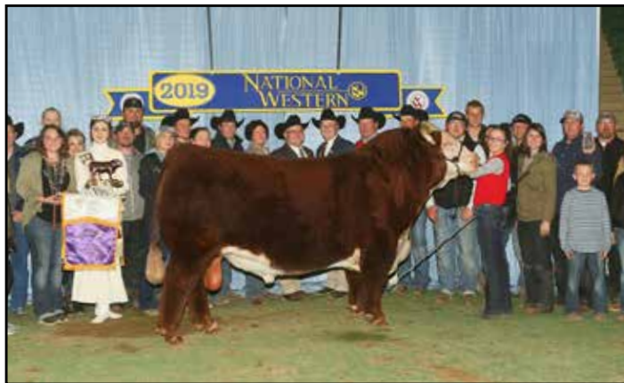
BR BELLE AIR 6011 SIRE OF LOTS 124 & 125