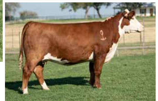
LOT 39 GKB 2296 REBECCA D919 1171