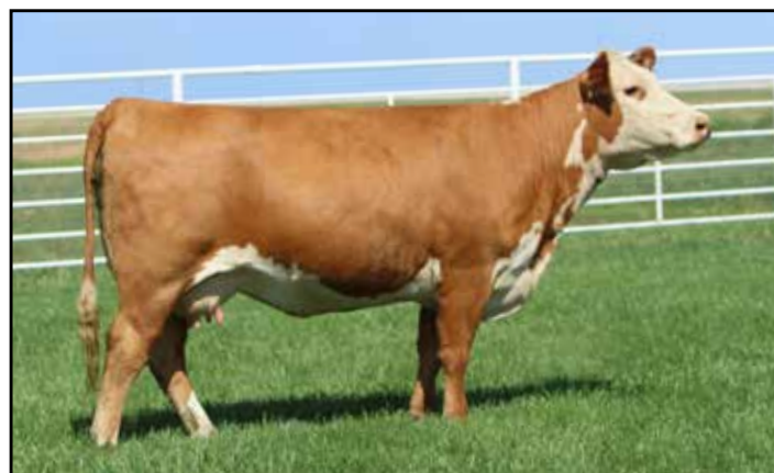
BR BRIANNE 4043 DAM OF LOT 113

LOT 111A Heifer calf, BR Aurora 3266 born 9/25/23 sired by BR Genesis 1202.