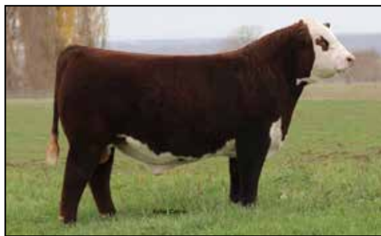
C GKB GUARDIAN 1015 ET SON OF LOT 201 DONOR