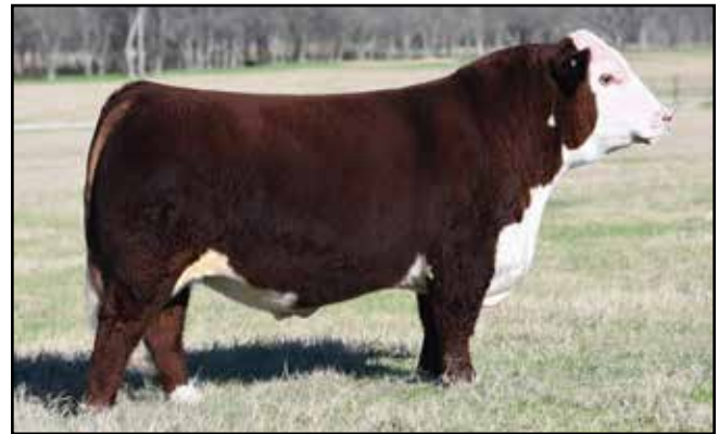
EKS DWK B26 FINAL CHAPTER SIRE OF LOT 205 EMBRYOS