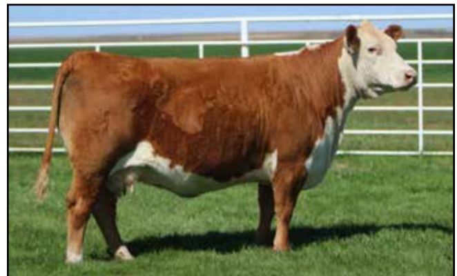
BR 124Y ALAINNA 4138 DAM OF LOT 205 & 206 EMBRYOS