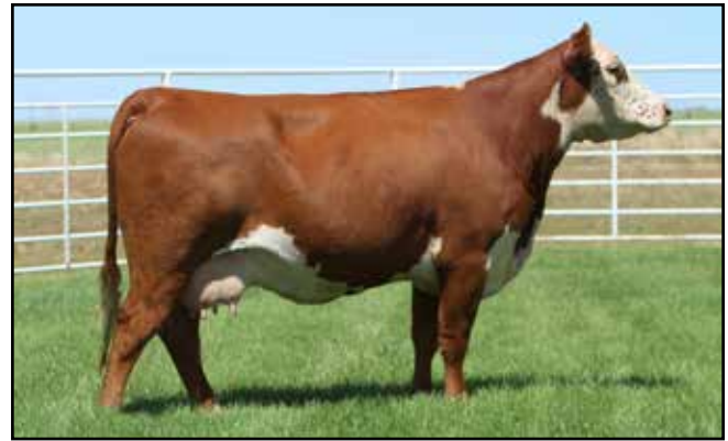
BR JASMINE 5026 DAM OF LOT 212 EMBRYOS