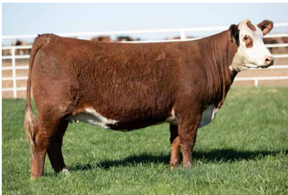
LOT 132 BR JENNA 2105