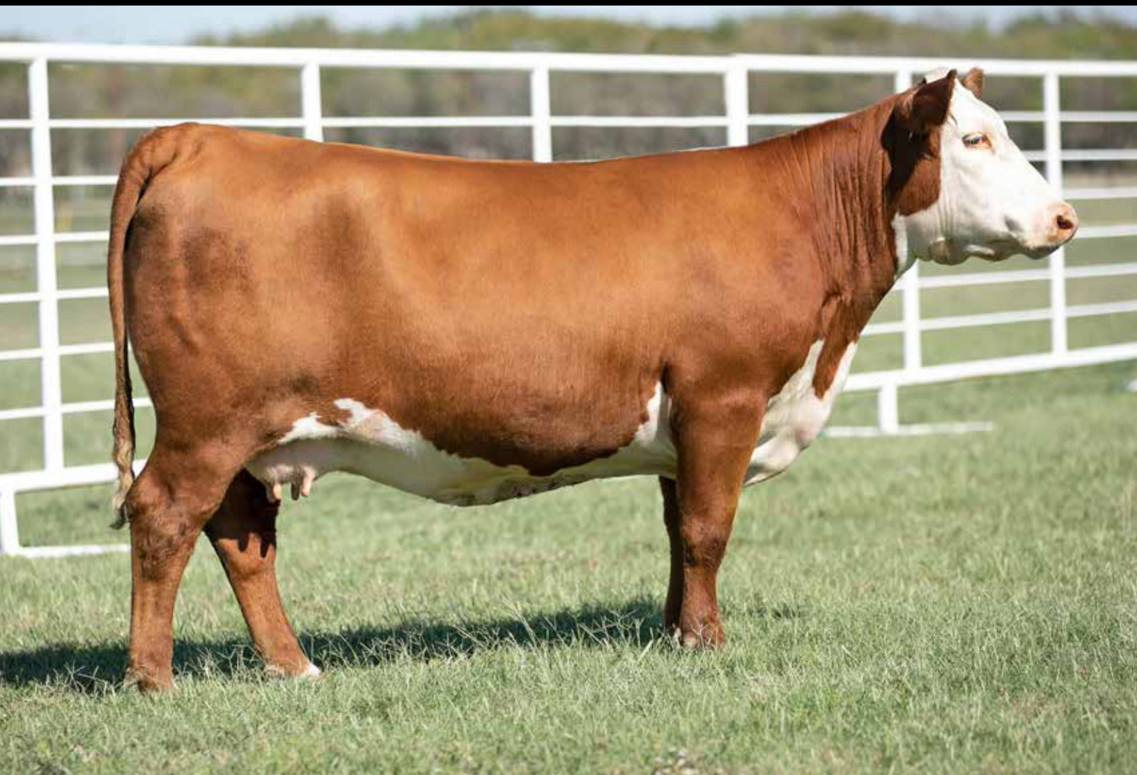
LOT 46 GKB 8123 BROOKLYN F017 1803