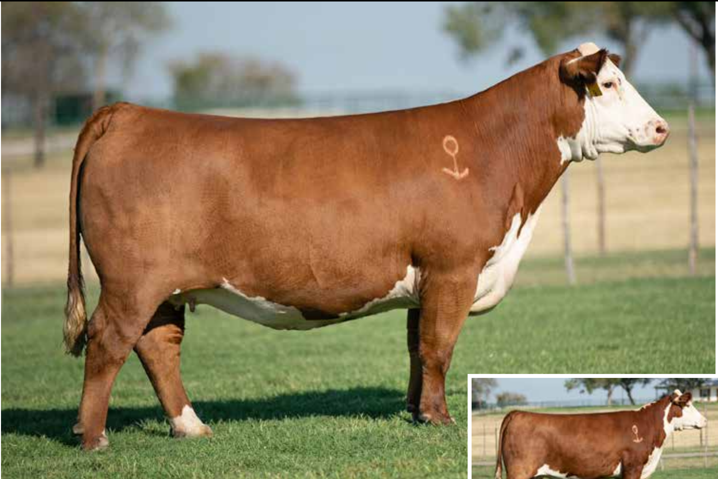
LOT 38 GKB 7210 BRIELLE J114 ET