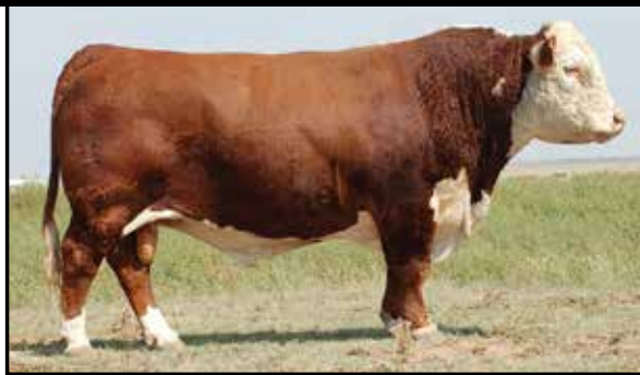
DM BR SOONER SIRE OF LOT 152