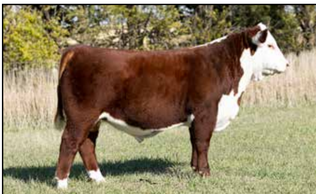
KJ GKB 364C IMPACT 249 J ET REFERENCE SIRE B