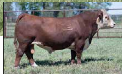
RST FINAL PRINT 0016 SON OF 8032