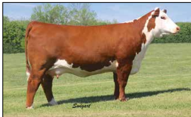
CSF 18U OLIVIA 2102 FULL SISTER TO DAM OF LOT 24

• 2694 is an elegantly designed November Horned female that you have to appreciate her femininity combined with her hip and superior phenotype. She is sired by BR GKB Sensation G015 ET who is a 2296 out of the infamous Anastasia 3023 and a full sister to the 2022 Polled Show Female of the Year, BR Merida H031 ET. Her dam, 7115, was the feature fall pair in the Iron Lake Dispersal and is a full sister to Olivia 2102 and comes from the legendary Gabrielle 5082 family.