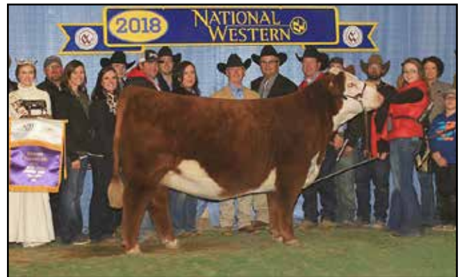
BR AMBER 6089 DAM OF LOTS 103-105

• Just a June heifer, but L179 is one that will be incredibly tough in that horned June division at JNHE. Really deep bodied, powerful, great made, and great haired with extra style. She's sired by the popular show sire KLD RW Marksman and out of Amber 6089, the 2018 Denver Grand Champion Polled Female.