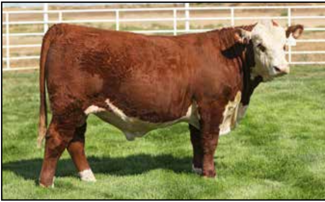
BR GENESIS H060 ET REFERENCE SIRE S