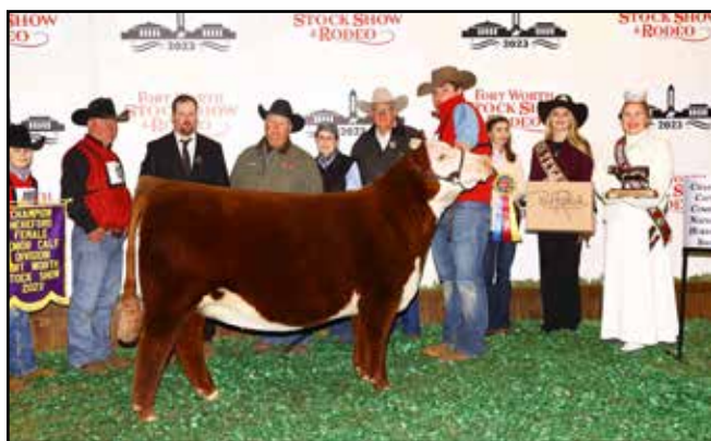
GKB 8123 BROOKLYN F071 1803 2023 FWSS GRAND CHAMMPION HORNED FEMALE