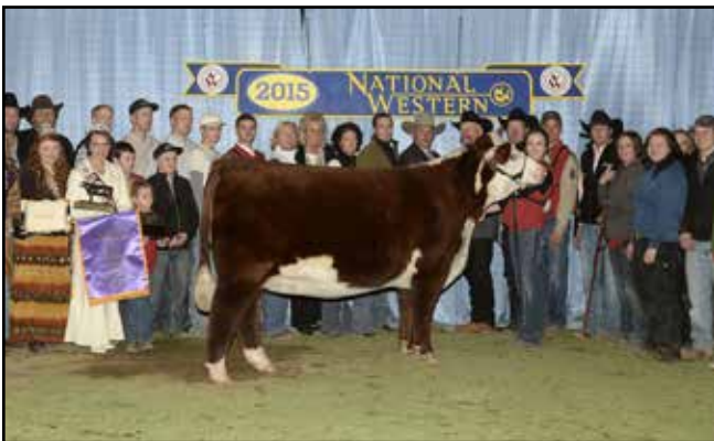
BR ANASTASIA 3023 ET DAM OF LOT 101 & 102