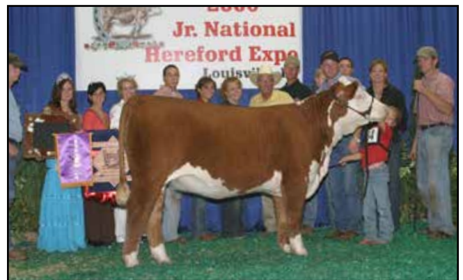
BR GABRIELLE 5082 MATERNAL GRANDDAM OF LOT 51

• 0204 is a heavily constructed daughter of BR Encore E085 ET that has power, bone, and substance in an eye-appealing package. Traces back to the immortal Gabrielle 5082 cow family and offers growth and value-added carcass traits.