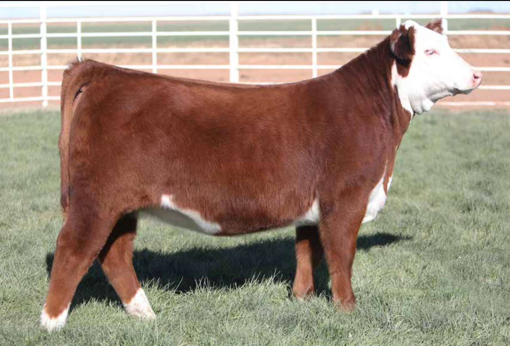
LOT 106 BR AMELIA L006 ET