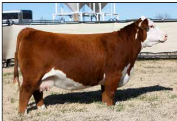
SULL TCC DIANA 4064B ET DAM OF LOTS 5 & 6