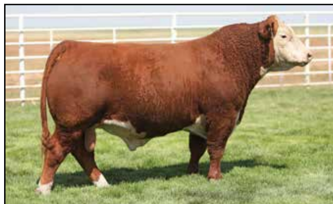
BR GKB CHARLIE 002A REFERENCE SIRE F