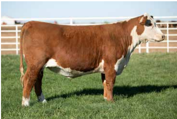
LOT 129 BR PISTOL ANNIE 2047