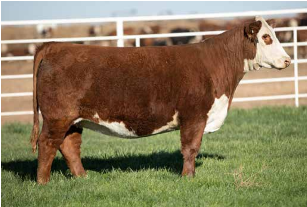
LOT 124 BR JAN 2027