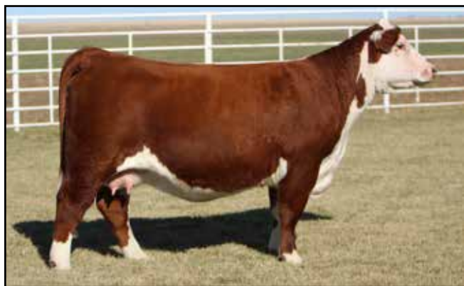
BR AMELIA E088 ET DAM OF LOT 106