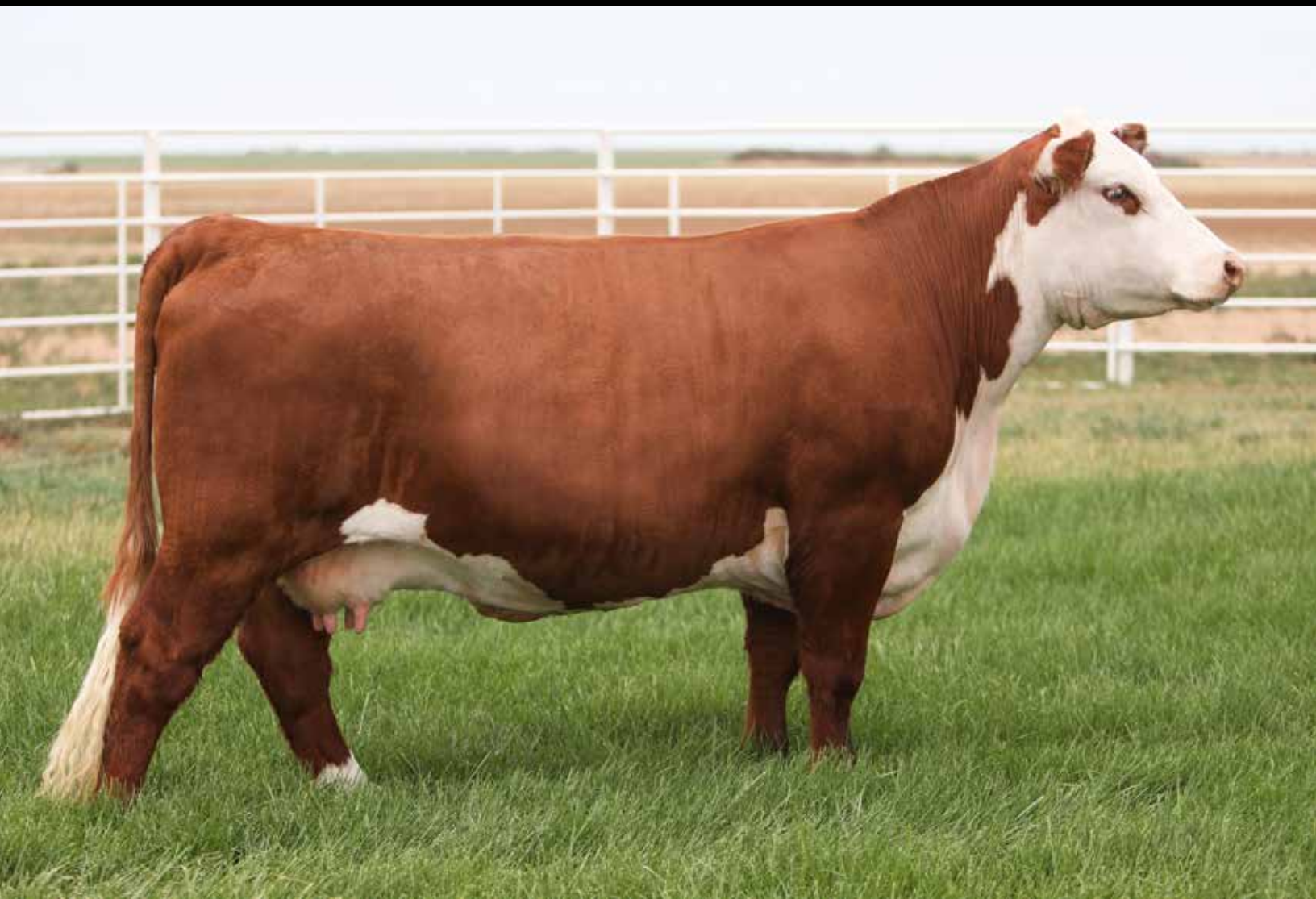
LOT 102 BR ANASTASIA G012 ET