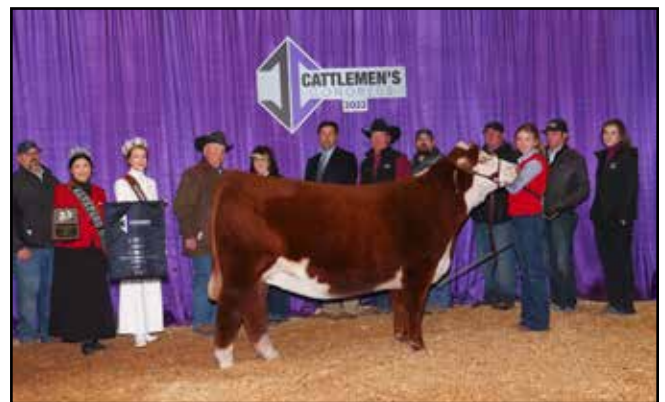
BR GABRIELLA 0142 DAM OF LOT 32