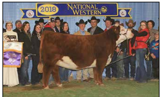
BR AMBER 6089 DAM OF LOTS 103-105

• This is easily one of our top females in this sale. H025 is a great young donor cow that is sired by Belle Air, the two-time National Western Stock Show Supreme Grand Champion and her dam is Amber 6089 who was the 2018 National Western Stock Show Grand Champion Polled Female. She's stout made, great looking, and flawless in her structure. H025 is short-marked with a red-eye and fantastic udder and has one of the top heifer calves in the sale on her side, sired by GKB Everest H088 ET. Adding Anastasia into her calf's immediate pedigree gives her 3 NWSS Grand Champions. H025 is a donor female that will add marbling, fertility, and eye appeal.