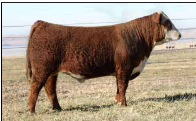
C CUDA BELLE 2111 REFERENCE SIRE C