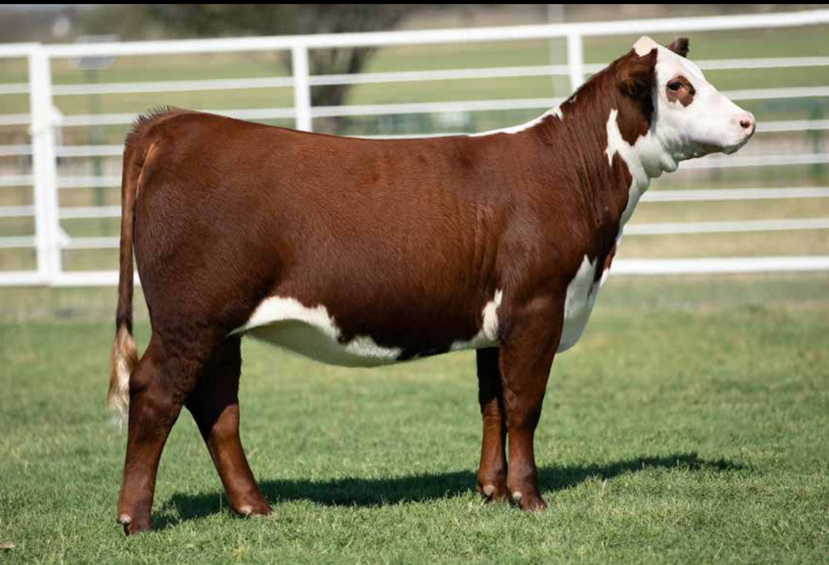
LOT 1 GKB 1015 NOTICE ME L106 ET