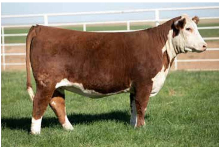
LOT 131 BR BROOKE RIELLE 2192