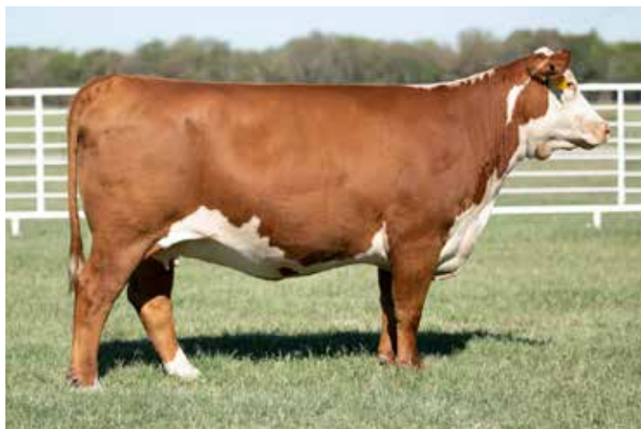
LOT 56 GKB BONNIE BLUE E076 0612