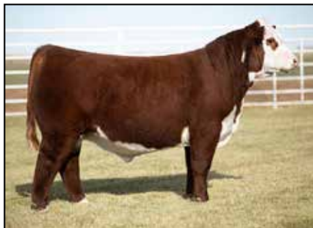
LOEWEN GENESIS G16 ET FLUSH MATE TO DAM OF LOT 31