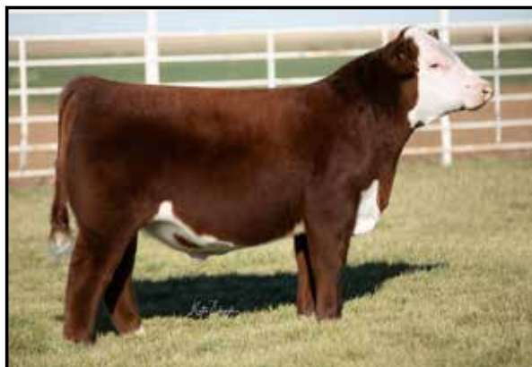
BR KINGSTON H028 ET SIRE OF LOT 133 & 134

• Smooth made and attractive Kingston daughter that is out of a Carol Channing daughter. Kingston is a maternal brother to Belle Air sired by 4030 that is dark red, stout made and has excellent growth and carcass. • P.E. from 5/2/23 to 8/6/23 to BR Blueprint 1311. Confirmed safe.