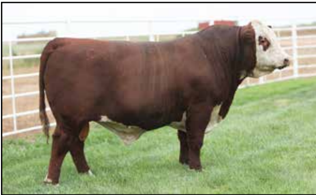
BR GENESIS 1202 REFERENCE SIRE T