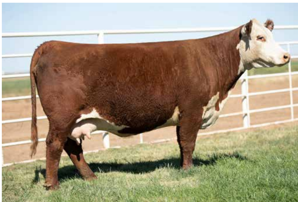
LOT 111 BR AURORA 0110