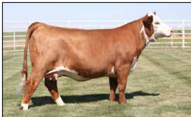
BR HALSEY 9099 DAM OF LOT 25