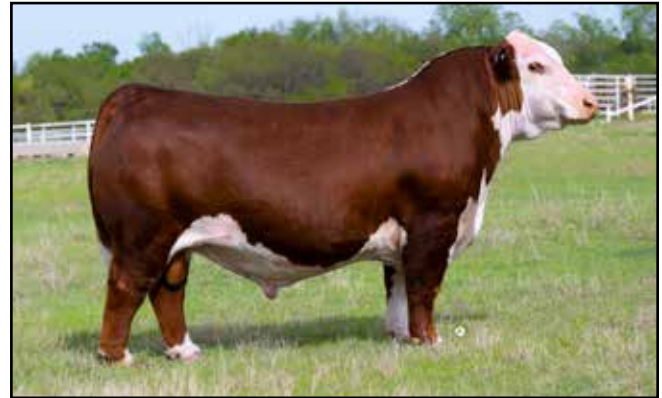
T/R GKB AC RED KINGDOM J16 SIRE OF LOT 213 EMBRYOS