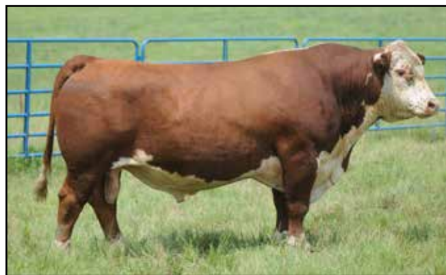
EFBEEF C609 RESOLUTE E158ET SIRE OF LOT 26