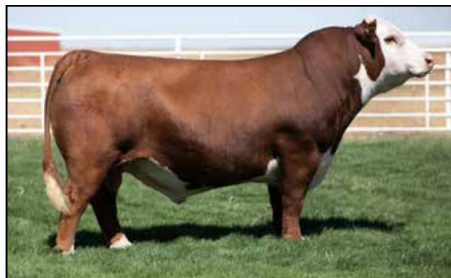
BR RARE AIR ET REFERENCE SIRE M