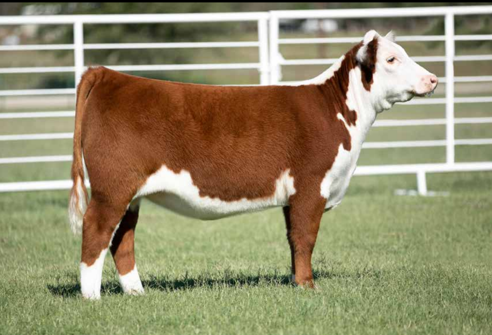
LOT 5 GKB J16 DIANA L110 ET