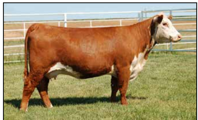
BR VIRGINIA GAEA 4073 DAM OF LOT 207 EMBRYOS