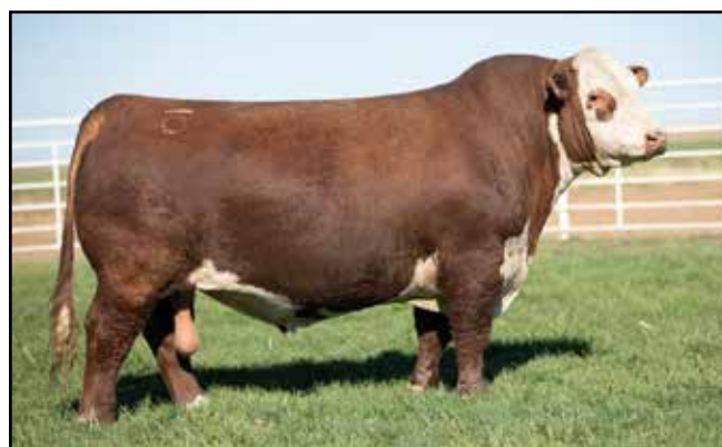
BR ENDURE H055 ET REFERENCE SIRE P