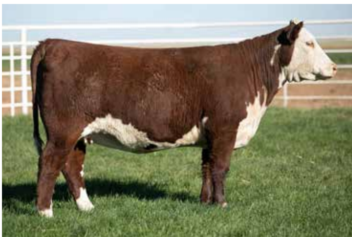
LOT 130 BR CAROLINE 2141