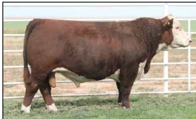
BR GKB ANCHOR 0017 REFERENCE SIRE E