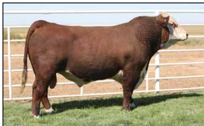
BR GENESIS J004 ET REFERENCE SIRE G