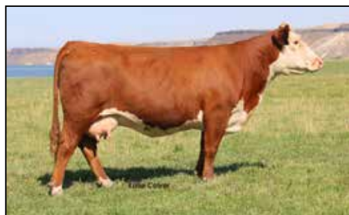
C 88X NOTICE ME 1311ET DAM OF LOTS 18 & 19