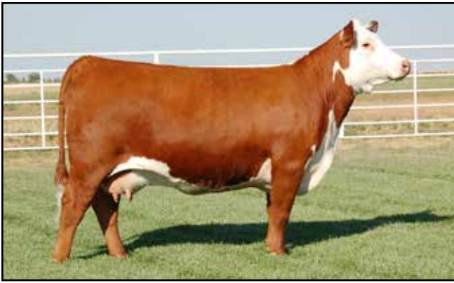
BR BELLE 4082 DAM OF LOT 208 EMBRYOS