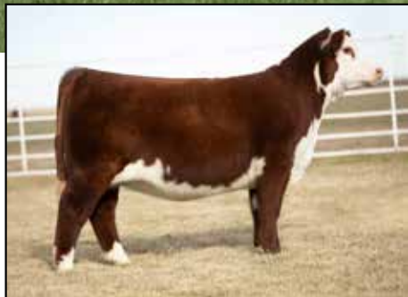
LOEWEN DMF RITA B42 G21 ET DAM OF LOT 31