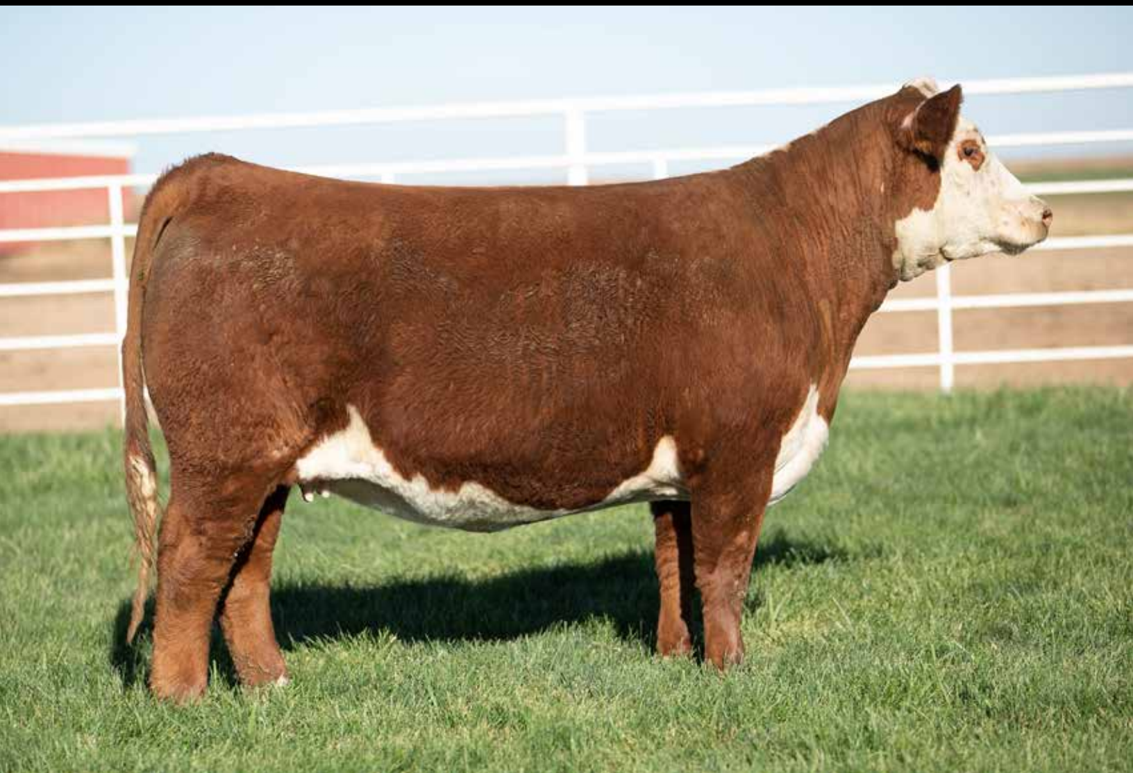
LOT 127 BR MISS FROSTIE 2058