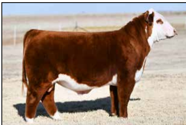
GREEN JCS MAKERS MARK 229G ET REFERENCE SIRE A