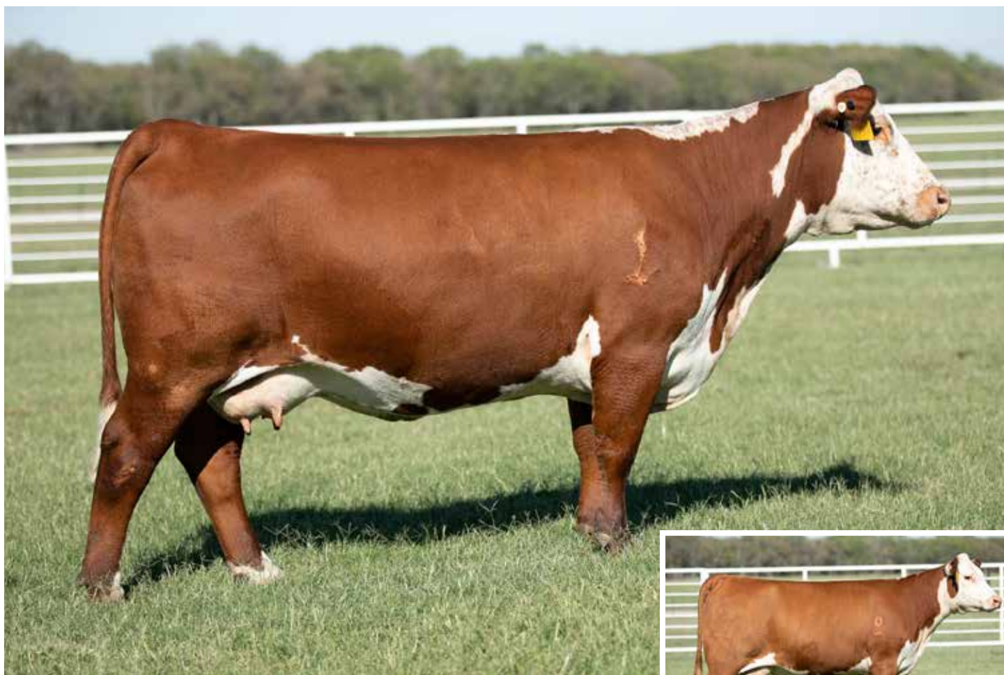
LOT 54 GKB 4084 MARIE 0600 ET