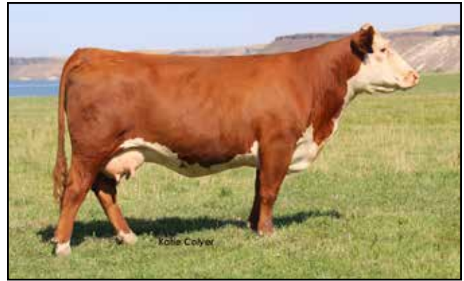
C 88X NOTICE ME 1311ET DAM OF LOT 204 EMBRYOS