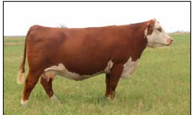
MSU RACHAEL 58Z ET DAM OF LOT 214 & 215 EMBRYOS