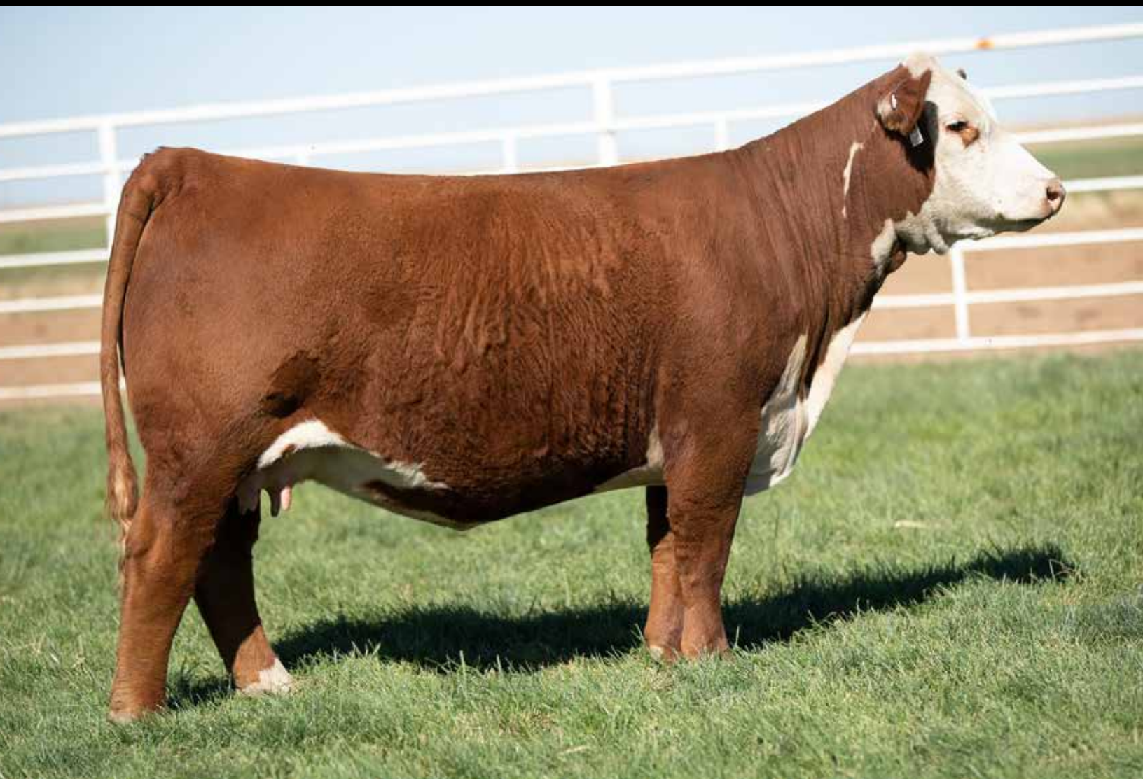
LOT 114 BR ALEXA J064 ET