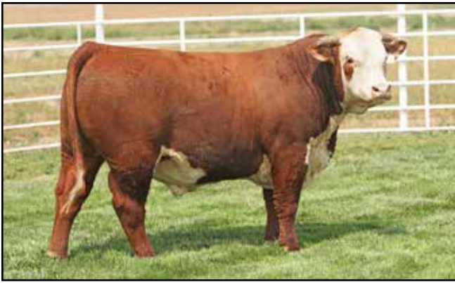
BR E085 ENCORE 0143 REFERENCE SIRE H