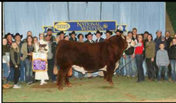
BR BELLE AIR 6011 SIRE OF LOTS 141 & 142