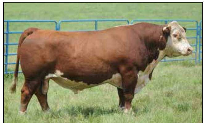
EFBEEF C609 RESOLUTE E158 ET SIRE OF LOT 215 EMBRYOS