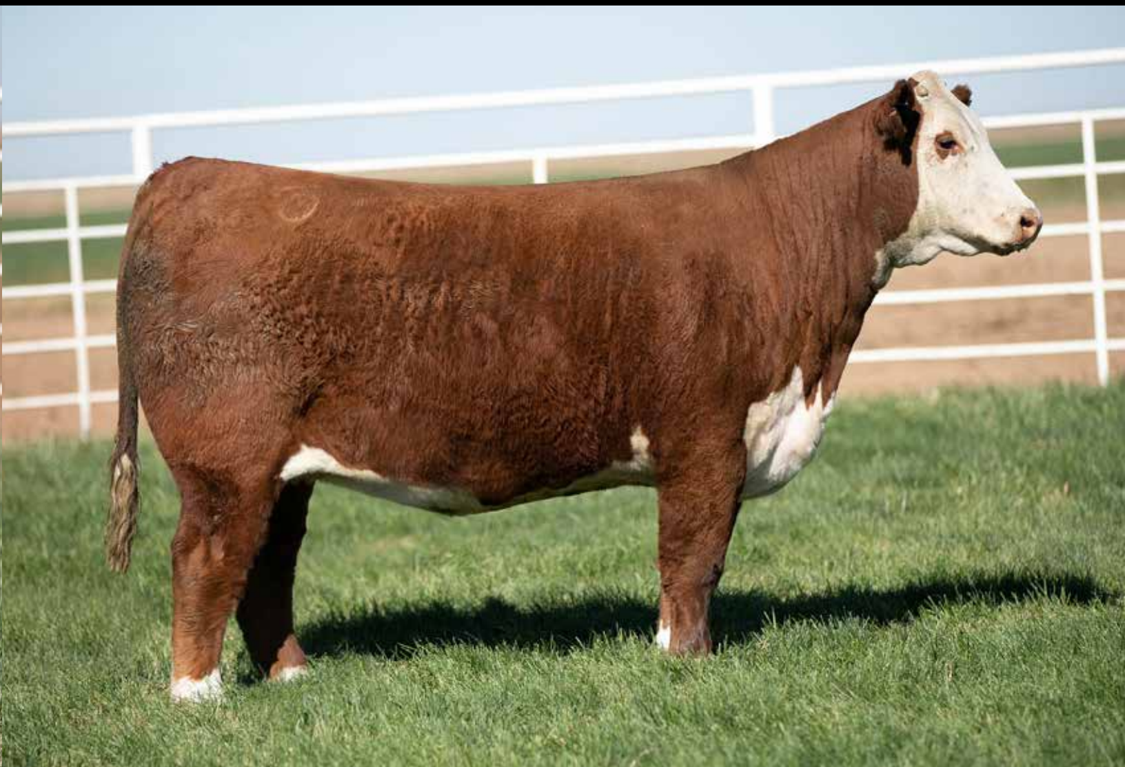
LOT 122 BR GABRIELLE 1368