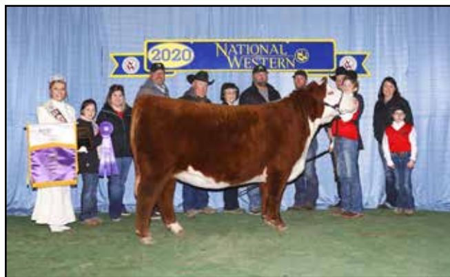
MCKY MONROE 8688 ET DAM OF LOTS 9-11