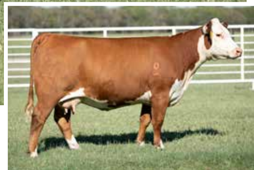
LOT 55 GKB 668Z MARIE 0539 ET