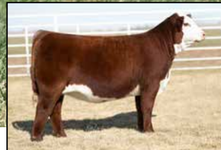
LOEWEN DMF GRACE B42 G17 ET DAM OF LOT 120