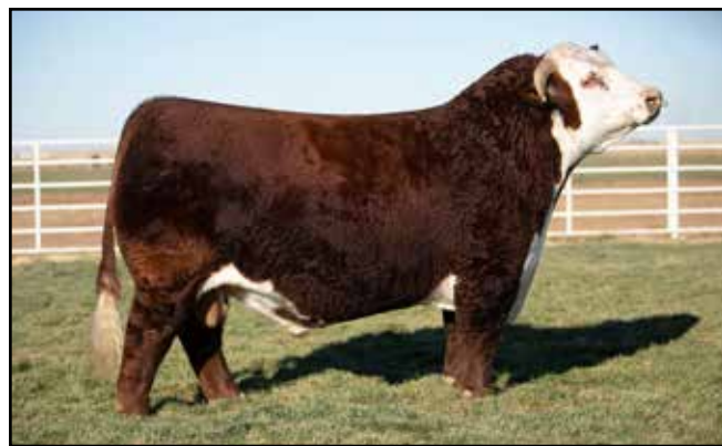
BR ER BIG COUNTRY 007 ET REFERENCE SIRE D