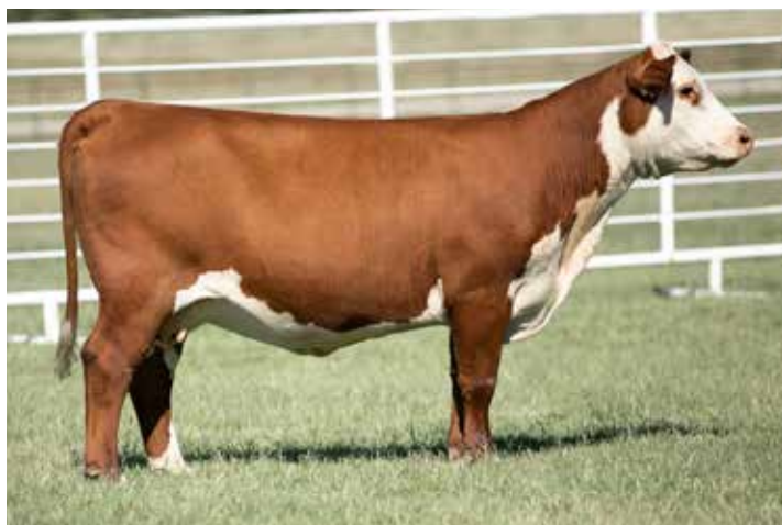
LOT 57 GKB 9609 6153 MALLORY 1507