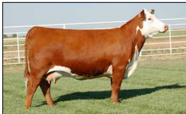
BR BELLE 4082 ET DAM OF LOT 2