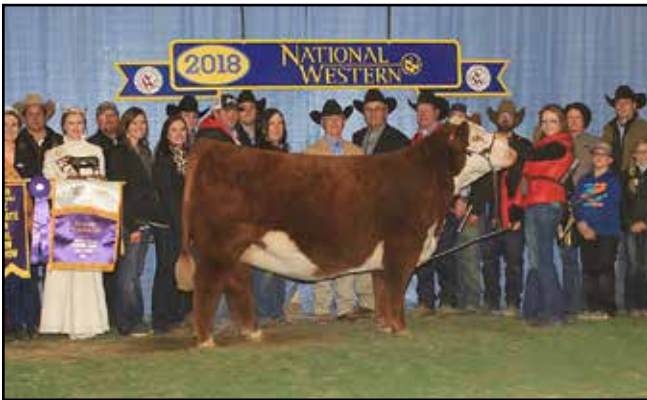
BR AMBER 6089 DAM OF LOT 209 EMBRYOS