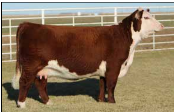
BR ANASTASIA E114 ET FULL SISTER TO LOT 101 & 102