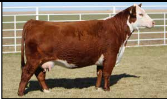
BR TEXAS ROSE 6796 ET DAM OF LOT 135