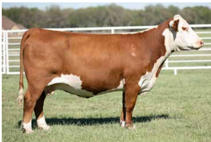
LOT 58 GKB 5142 LILLY 12E 0119 ET