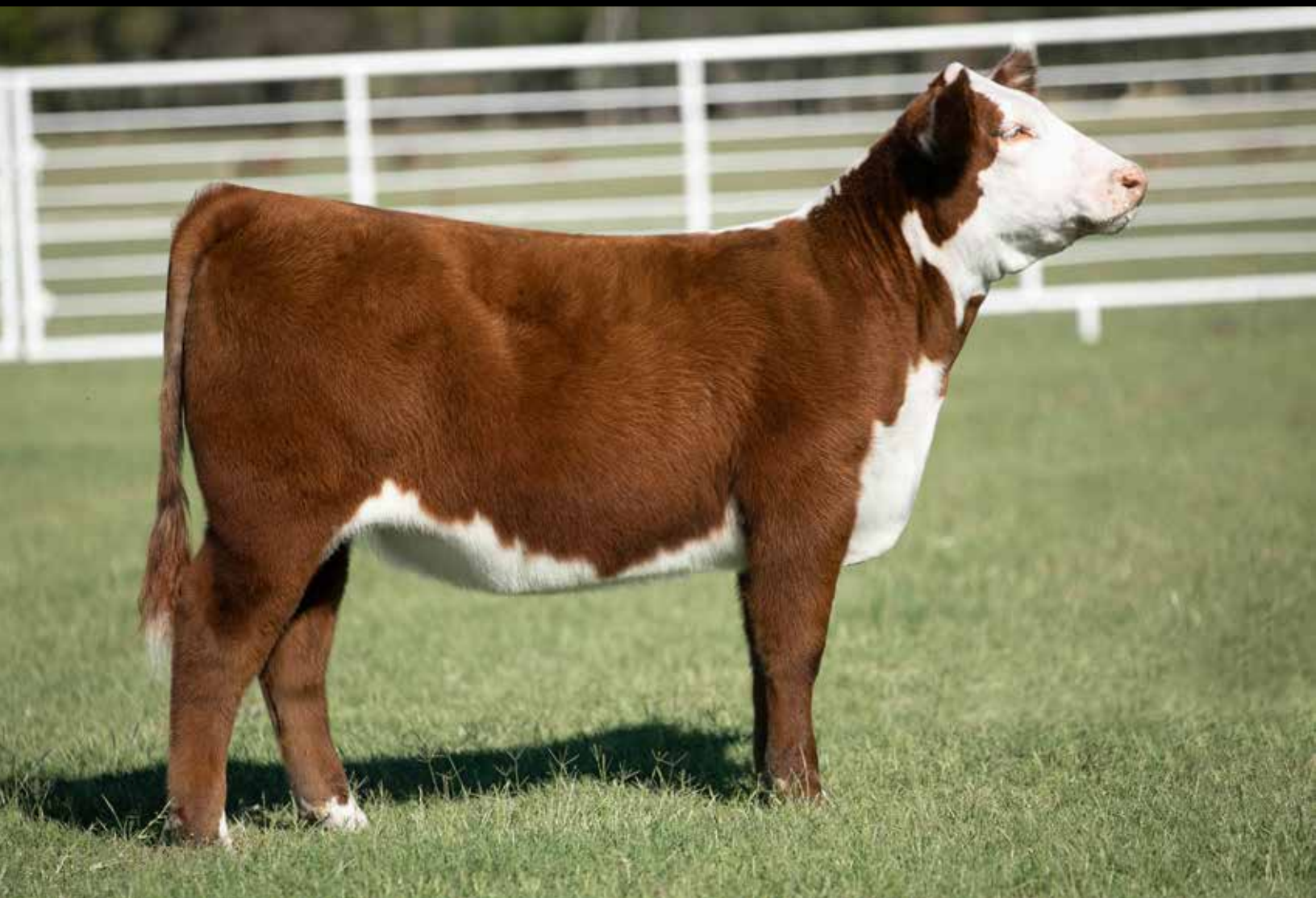
LOT 3 GKB 1015 MONROE L127 ET