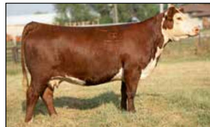
RST MS 504C CUDA 1150 DAUGHTER OF 8032

• 8032 is the donor dam of the ever-popular RST Final Print 0016. Final Print was her first natural calf and her second natural calf is a donor female sired by Cuda that is working for the Loewen Hereford and Candy Meadows Farm programs.