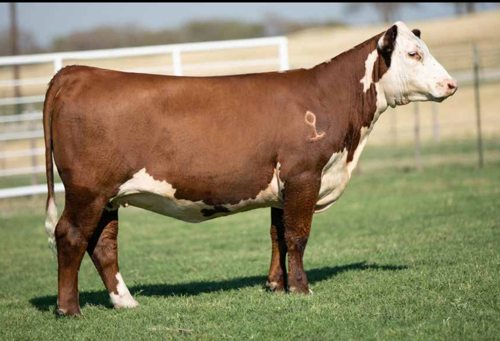
LOT 25 GKB G015 HALSEY K153 ET