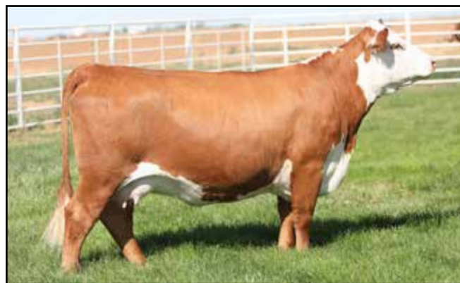
BR NALA H040 DAUGHTER OF LOT 107

• Amy Rielle, or “Split” as we call her, was the last Sooner x Gabrielle daughter ever born. Without question the Sooner x Gabrielle bloodline was the most dominant bloodline BR ever produced. It would start with 8052 (Dam of Belle) and 8130 (Dam of Anastasia and countless others). Split was Grand Champion at JNHE in the bred and owned show as both a fall calf and the next year as a senior yearling. She’s been a great producer and is the dam of Amelia, one of our main donors, and Nala who won the Texas State Hereford show a couple years ago, along with many others. GKB raised a Ringo son out of a daughter of her as well that you will be hearing a ton about in the near future. The only reason Split is being offered in this sale at 8 years of age is because we have that Sooner x Gabrielle bloodline in just about every pedigree we have. She may be 8 but she’s so big, stout, and great made that you can’t tell it. This proven donor cow can get you in the backdrop instantly.