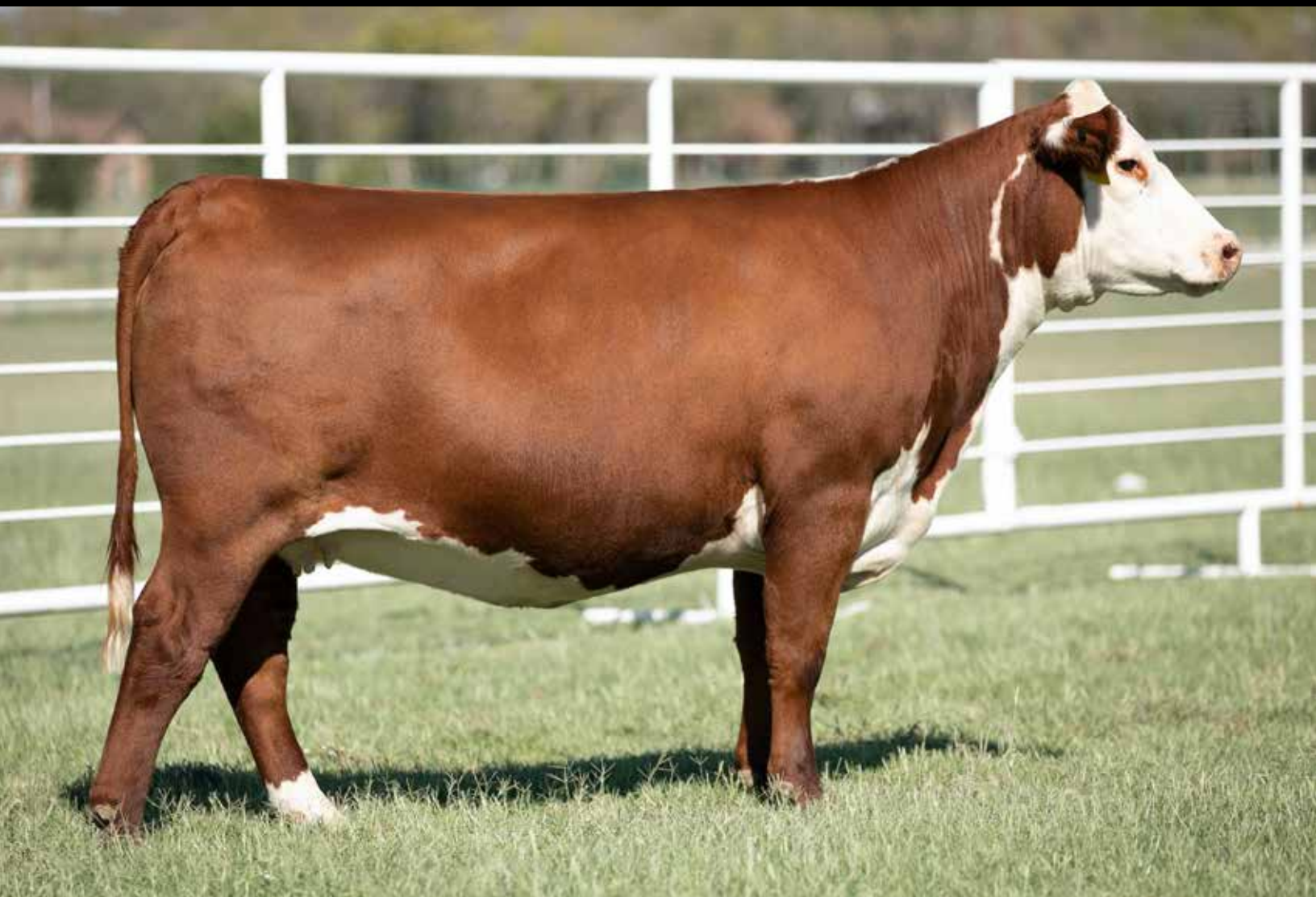
LOT 37 GKB 6153 GABRIELLE 1174