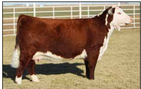
BR ANASTASIA E109 ET FULL SISTER TO LOT 101 & 102